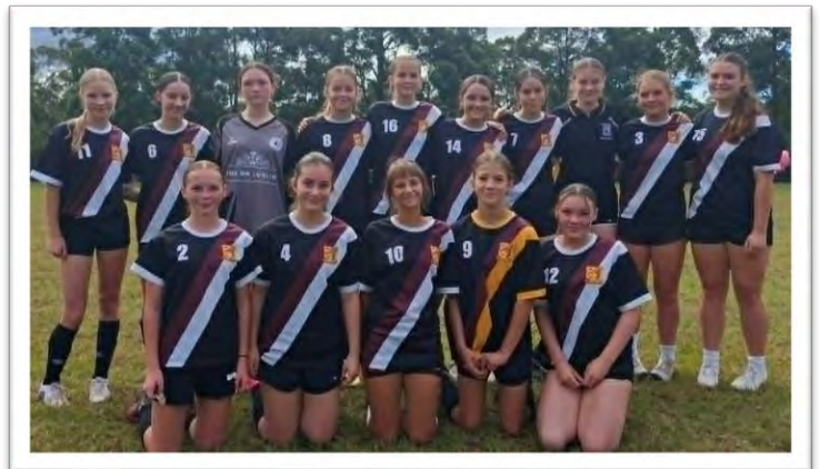
U15 Girls Soccer Team