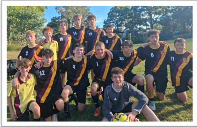
U15 Boys Soccer Team

There are many teams still alive in Knockout competitions, including the Open Girls Soccer team, playing their Regional Quarter Final as this edition goes to publishing.