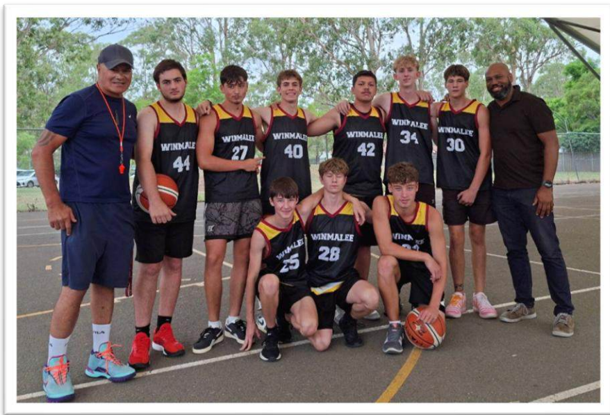
Boys Basketball, 60-17 vs Cambridge Park HS