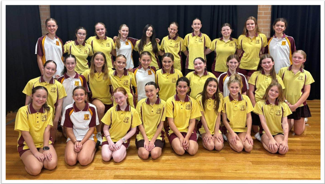
The PULSE Alive dance team had a rehearsal last Thursday in preparation for their performances next term. We are excited to bring a large Year 7 cohort with us for the first time.

Parents and carers of our current Year 7 students are invited to a Meet the Teacher evening on Tuesday 10 March from 5.30pm - 6.30pm.