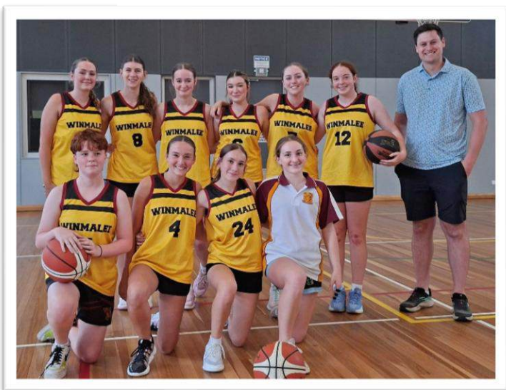
Girls Basketball, 45-24 vs Jamison HS