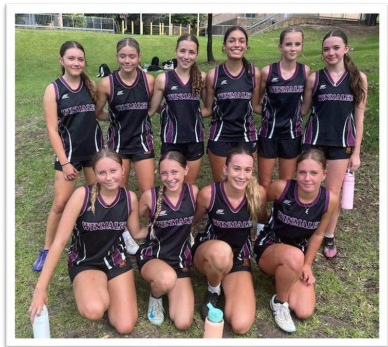
Girls Touch, 16-1 vs Springwood HS