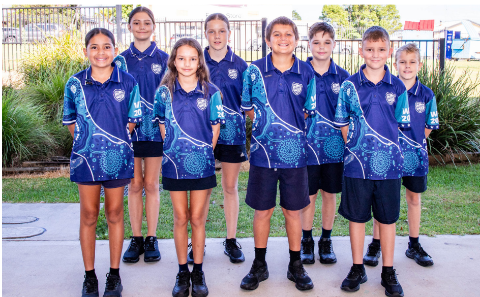
Wauchope PS Student Leaders 2026