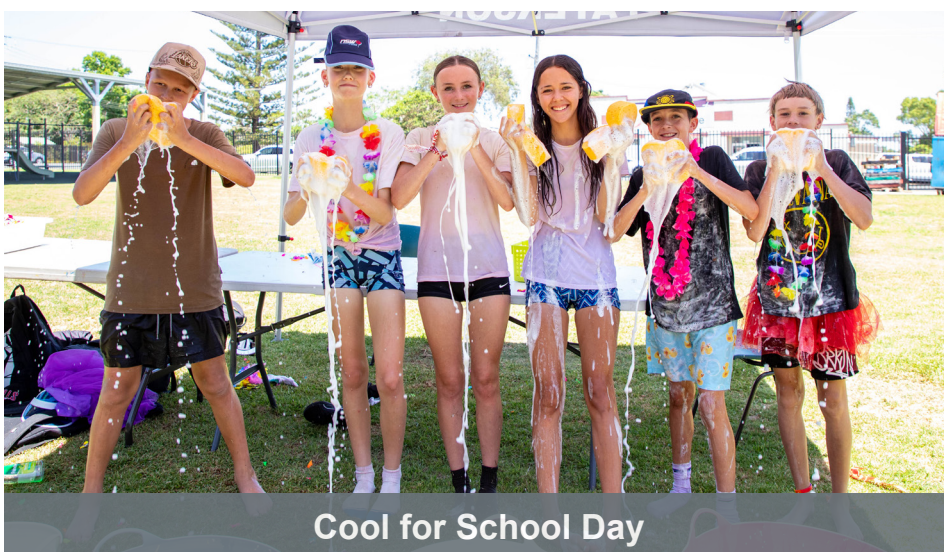
Cool for School Day