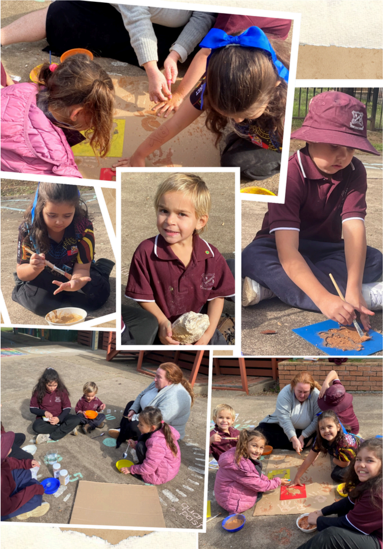
Creating art with Ochre