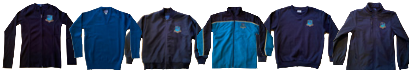
Girls Black Wool Blend Cardigan

All jackets and jumpers are allowed to be worn with School and Sports uniforms.