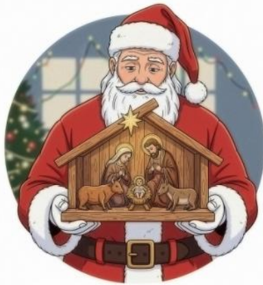
Trundle Parish Anglican Church Christmas Service Times 2025

Trundle Central School is advertising the following as a community service. The school has no responsibility for the organisation and management of these events.