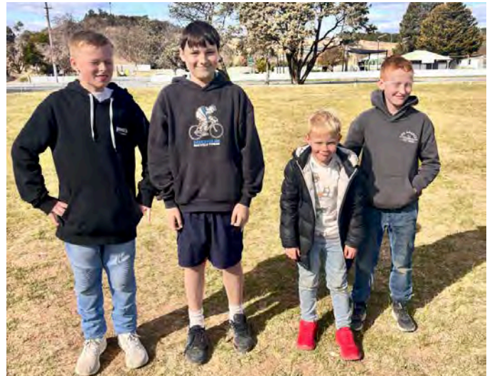
Jeans for Genes Day

HEALTHY FOOD – at Tarago PS, we aim for students to choose healthy foods for their lunches and recesses. Raw, unprocessed fruit and vegies are the best option for snacks along with the simple old sandwich with a healthy filling are a great option for lunch. If kids are involved in the making and chopping up, they are more likely to wolf it down at school! The less packaged food we eat, the less salt, fat and sugar we consume, which is a good thing!!! And less rubbish as well!!!!