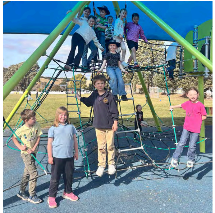
Jeans for Genes Day