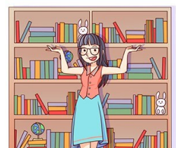
The school redeems Scholastic Rewards for additional resources