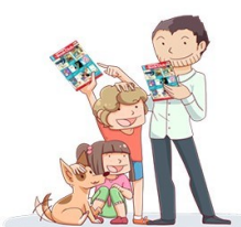
Families order from Book Club.

Every purchase you make earns your child's school 15% of your order value in Scholastic Rewards that can be used to purchase valuable educational resources that benefit your child.