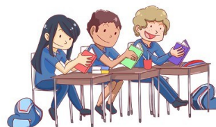
The school earns Scholastic Rewards.