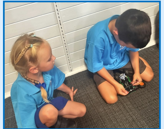
Forces in Science and a very productive "Clean up Australia Day".