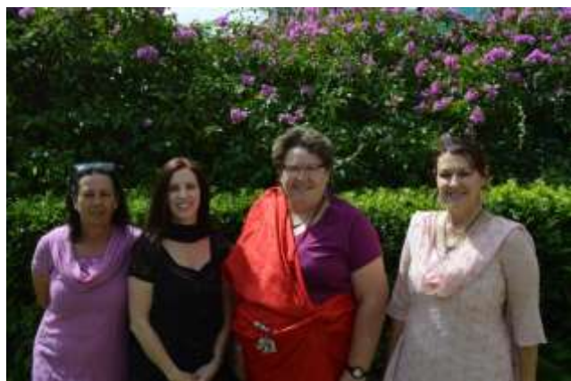
Some of our wonderful SASS staff here at Quakers Hill HS.