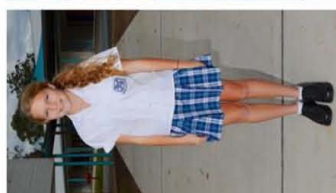
Girl's School Uniform