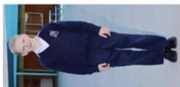
Boy's School Uniform