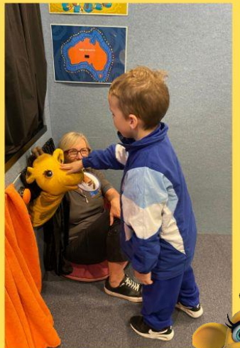
Life Education Visit