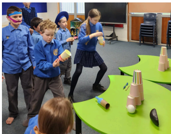
They enjoyed competing against each other in Cupstack Knockdown.