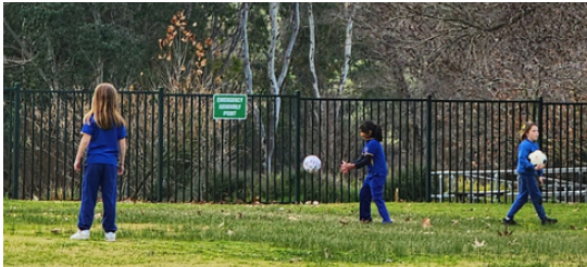
We spent an afternoon enjoying the warmer weather playing soccer and doing cartwheels.