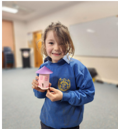
We made some little fairy houses to take home.