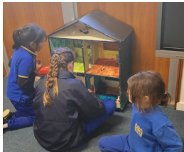
Chilly afternoon so we stayed indoors in the warm to play and colour in.