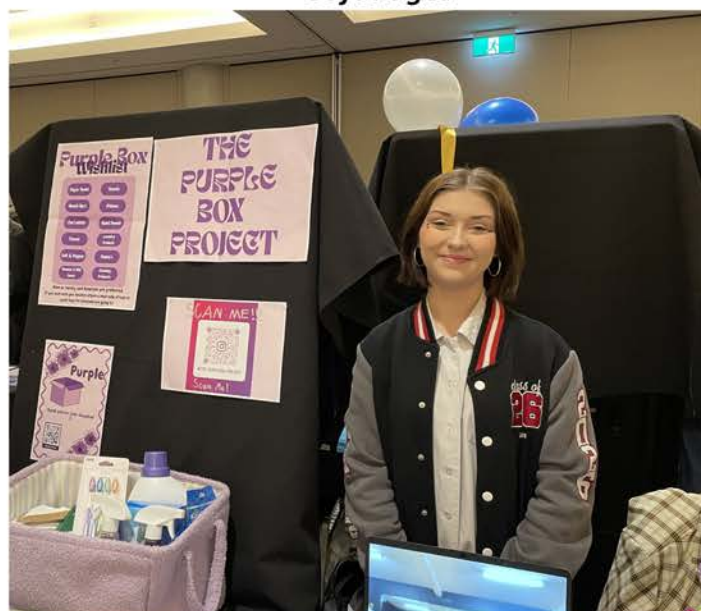
Purple Box Project