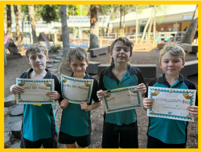
Congratulations to our Week 4 Bumble bees