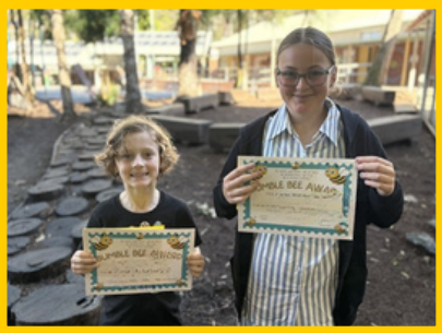
Congratulations to our Week 4 Bumble bees