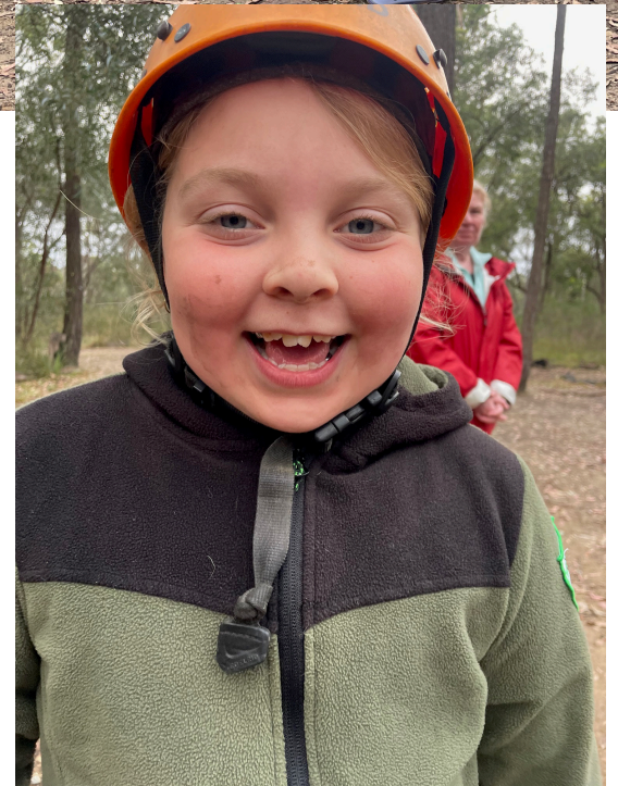
Even the rain couldn't dampen spirits as the kids all worked together to save the minions from the apocalypse and used teamwork to pull each other up to the highest point of the flying fox.