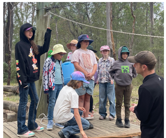
The Cave Maze night activity, was both challenging and rewarding but was one of their favourite activities. Early morning chess was a hit too.