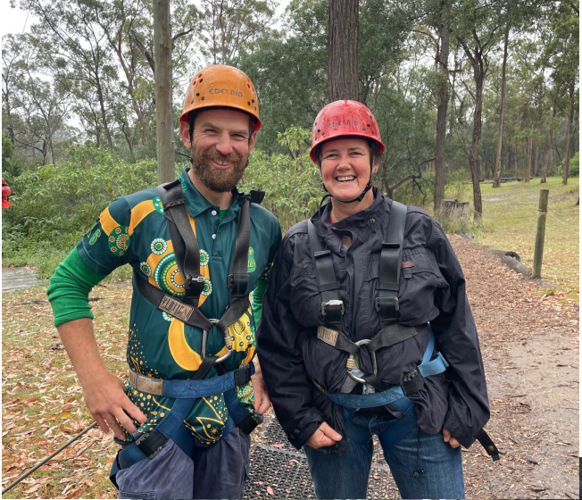
The giant swing was definitely everyone's favourite activity and they all would love to go back and have another turn! Even the staff braved the swing and enjoyed it.