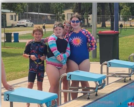
Senior Relay Team