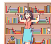
The school redeems Scholastic Rewards for additional resources