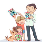
Families order from Book Club.

Every purchase you make earns your child's school 15% of your order value in Scholastic Rewards that can be used to purchase valuable educational resources that benefit your child.