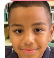
Rugby with Brighton