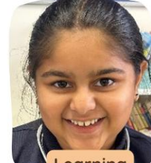
Learning Interesting things in class