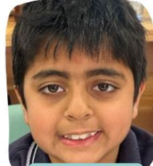
Making New Friends