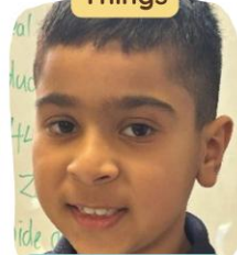
Learning New Facts