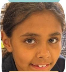
Crunch & Sip