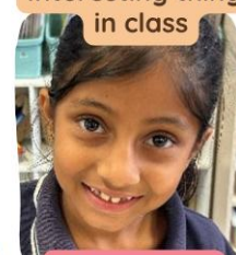
Friends in 3F