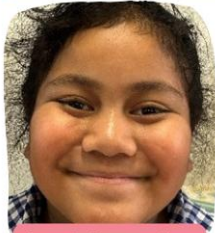
Art & Learning New Facts