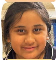
Learning new Things