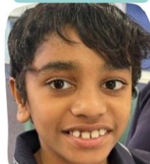
Library is close