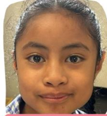
Doing Go Noodle Dances