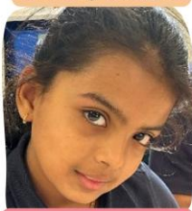
Class Points and Rewards