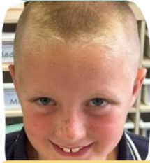
Close to Canteen