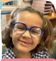
Close to Library