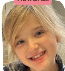
New Friends in 3F