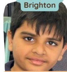
Spelling Tests on Fridays