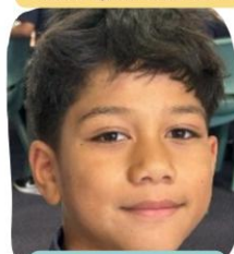
Class Spelling Bee