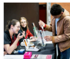
DNA extraction MACQUARIE UNIVERSITY FACULTY OF SCIENCE AND ENGINEERING

FIND OUT MORE Access and Booking Participation Macquarie University NSW 2109 Australia T: +61 (0) 2 9515 9823 E: spike@mq.edu.au @macquarieuniversity mq.edu.au/ucap