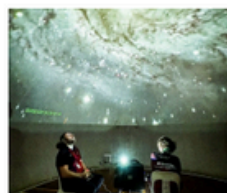
Planetarium MACQUARIE UNIVERSITY ASSOCIATION FOR ASTRONOMY

Just some of the activities you will experience: