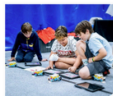
Spike LEGO MACQUARIE UNIVERSITY JUNIOR SCIENCE ACADEMY