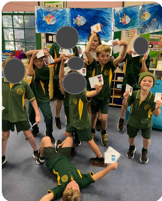
Term 1, Week 3 100%