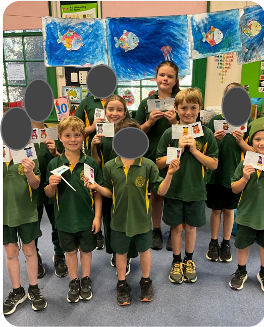
Term 1, Week 1 & 2 100%