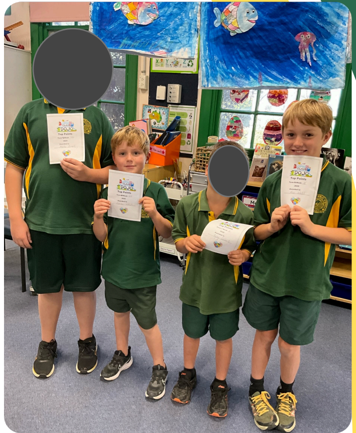
Top Points -Week 1, 2 & 3