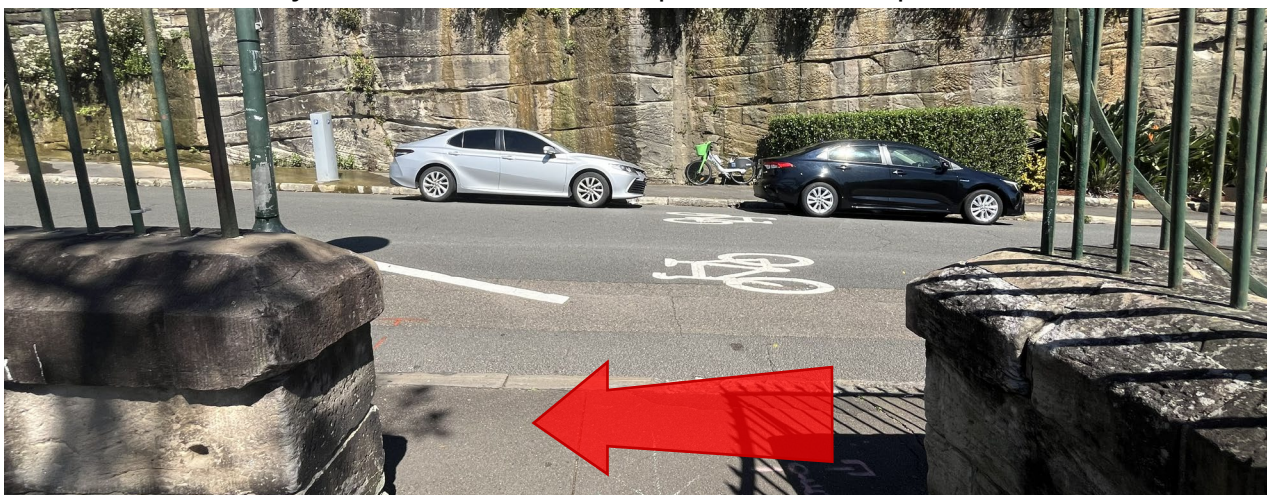
At the top of the steps, pedestrians continue on the designated footpath on Watson Street.