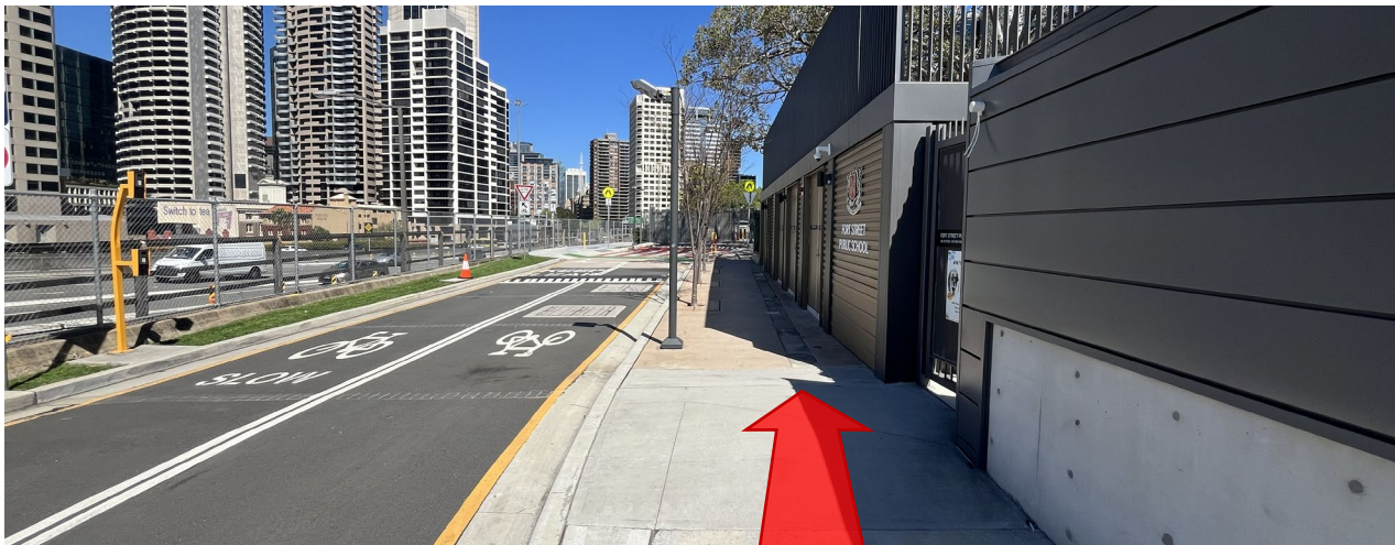
Following the crossing, pedestrians proceed along the footpath to the school gates