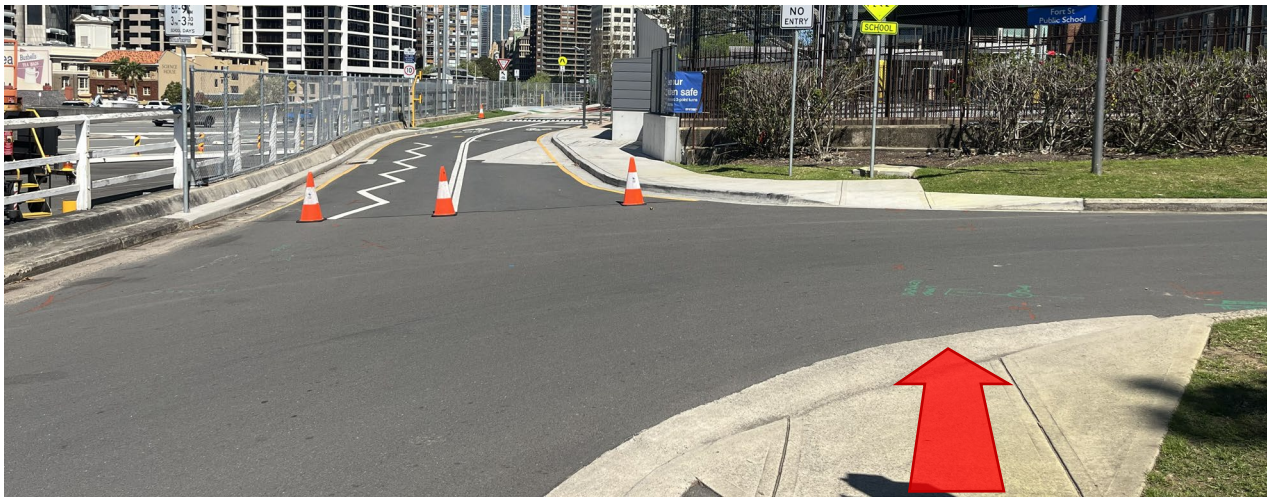
At Upper Fort Street, pedestrians cross towards the school.