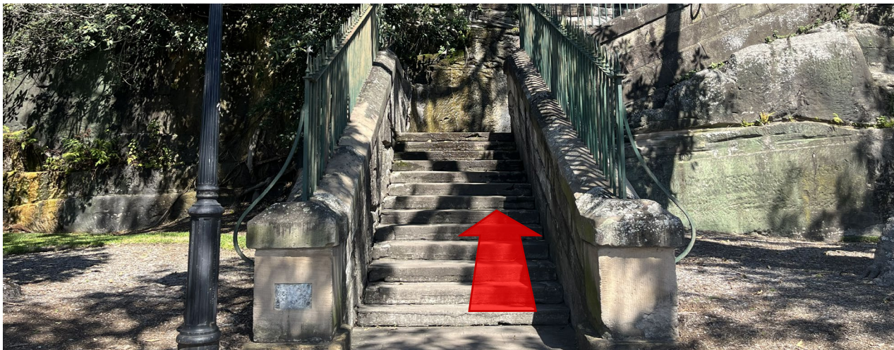
Pedestrians may use the Watson Road Steps to reach the top of Watson Street.