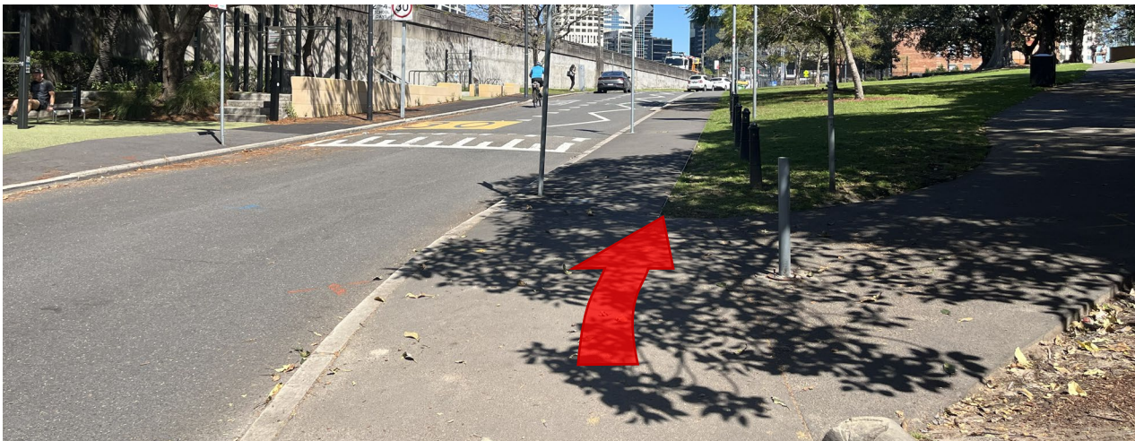
Pedestrians then proceed along Upper Fort Street towards the school.