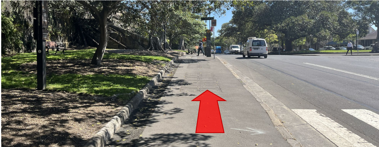
From the Drop-off & Pick-up area on Argyle Street, walk towards the Watson Road Steps.