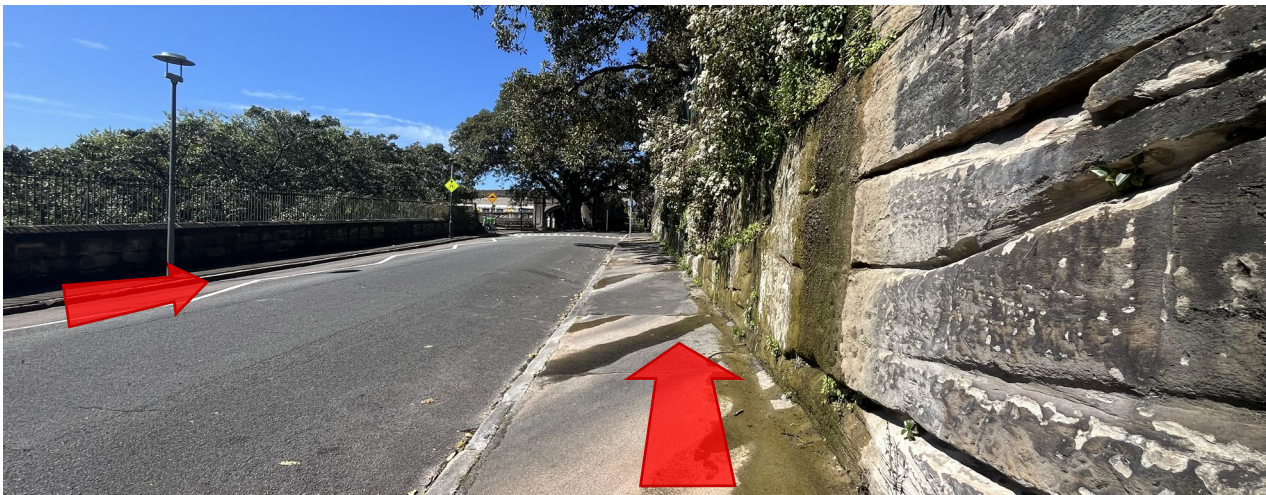
After crossing, pedestrians continue along Watson Street, remaining on the designated footpaths.