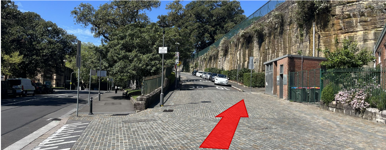
Alternatively, pedestrians who have come via the Argyle/Watson intersection can cross at the shared space where the wider footpath safely accommodates pedestrians.