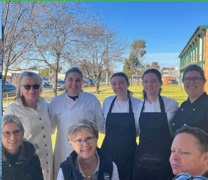
Principal and Head Teacher Sydney visit and Staff Development Day lunch