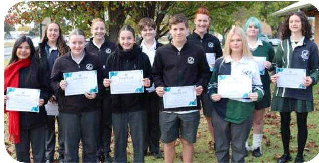
CAPA/TAS Awards for consistent effort in Semester 1 Years 9-12