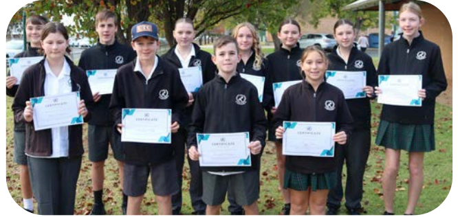
CAPA/TAS Awards for consistent effort in Semester 1 Year 7-8