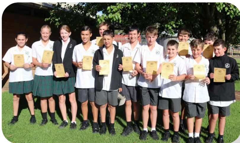
Principal Award recipients at Tuesday morning assembly