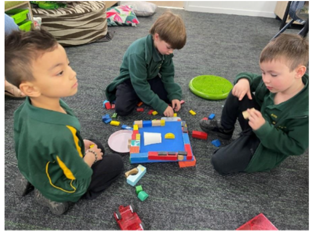
Kindergarten students learning through play.

In science , we've been exploring forces, learning how pushes and pulls act on objects to make them move or change direction. We linked this to things we see in everyday life—like in pinball machines or sports when we kick or bat a ball. We even created our own mini-golf course with obstacles! Students experimented to see how the marble's movement changed when they added barriers or guides to help it reach the hole.