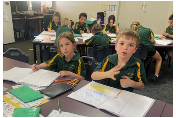
Kindergarten students working hard during their first week back.

In Maths this week, we have been reviewing how to read and write numbers to 20, using number lines and MAB blocks to identify one more and one less.