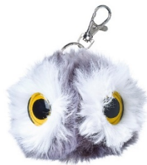
Arctic Owl Fluffy Keyring

Exciting new Term 3 Polar Savers rewards are now available, while stocks last!