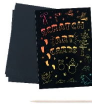
Scratch Art Cards

For every deposit made at school students will receive a silver Dollarmites token. Once students have individually collected 10 tokens they can redeem them for exclusive School Banking reward items in recognition of their regular savings habits. There are two new items released each term so be sure to keep an eye out for them!