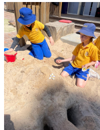
SRC Sandcastle competition