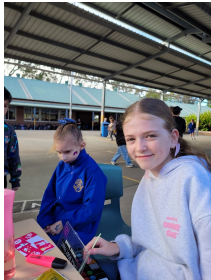
Year 6 Tonne of Fun