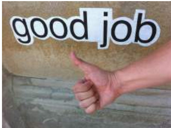
14 - Great work all or our Principal Award recipients.