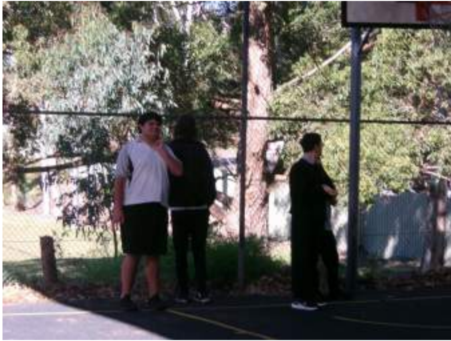
11 - Students checking their heart rate