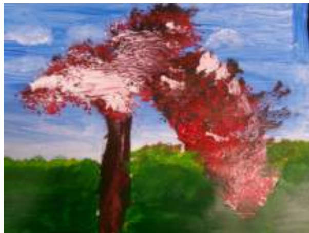
7 - Zac