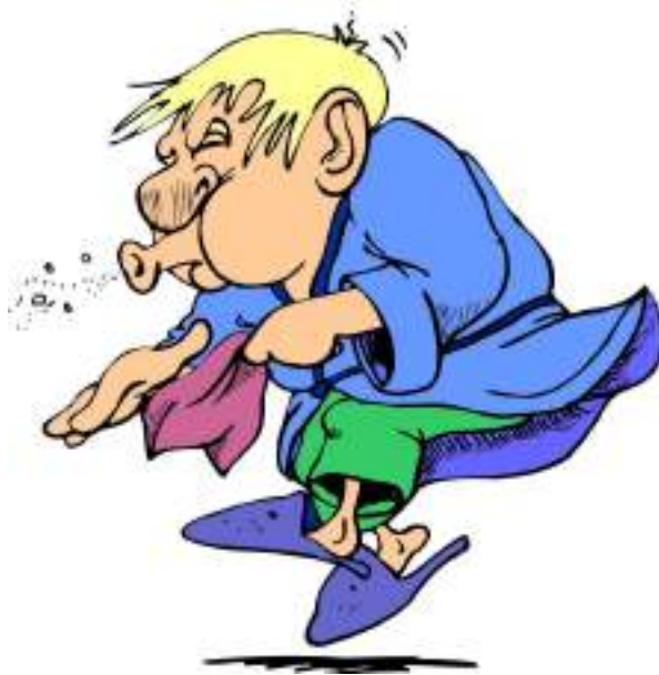
15 - Help us stop the spread of colds and flu.... if your child is sick please let us know and keep them home until they recover.