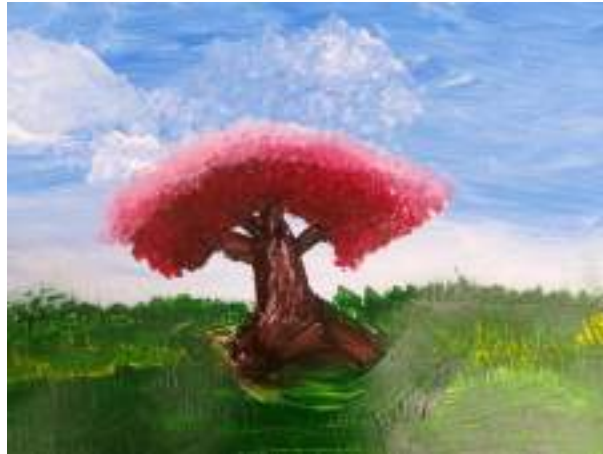
8 - Archie