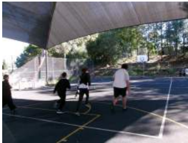
12 - Students increasing their heart rate by running