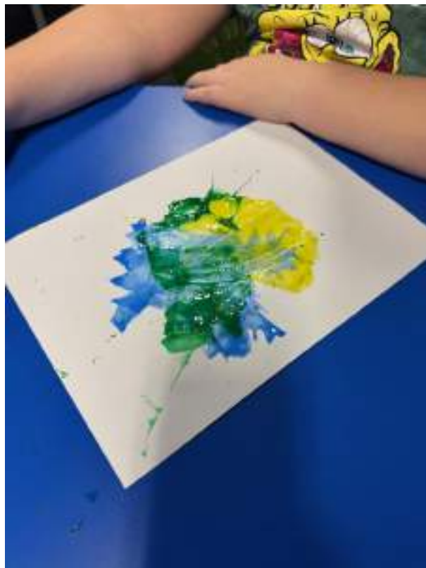
3 - Boyd's creation