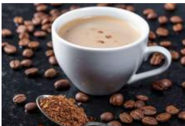
13 - Transition Program - Barista training