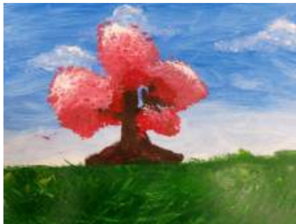
10 - Toa