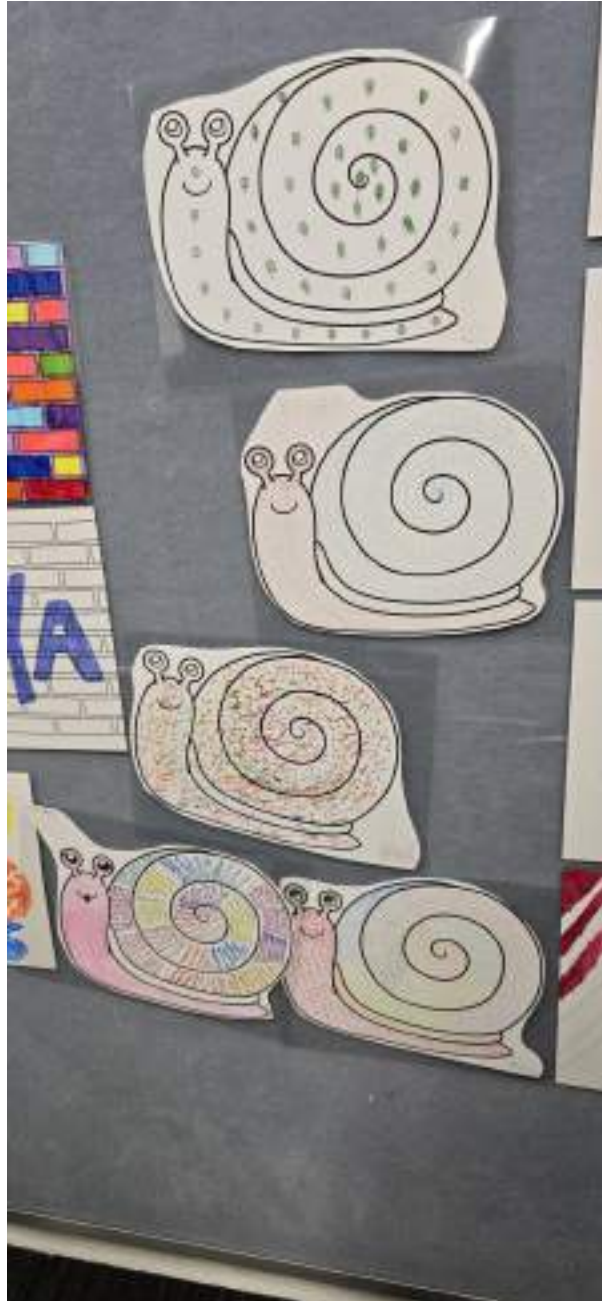
6 - Pointillism art