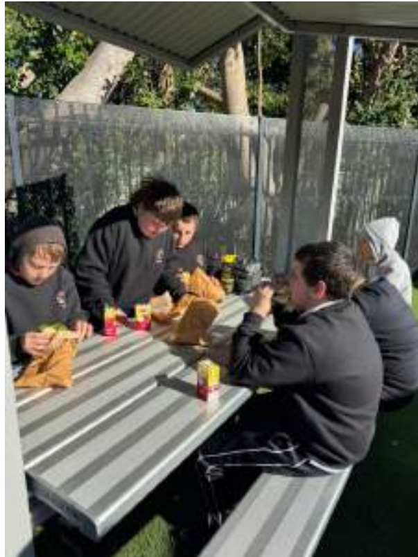
2 - Carinya Cafe