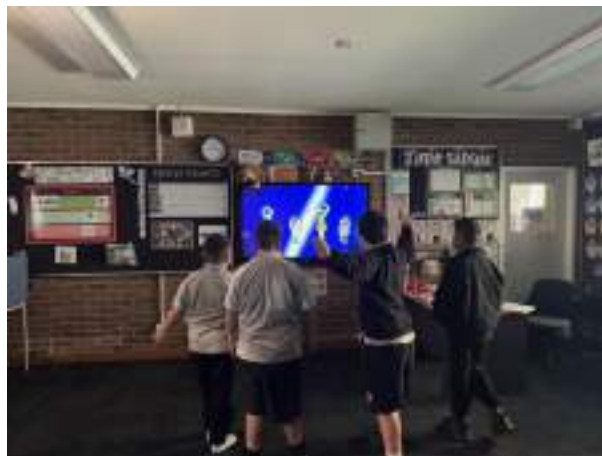
5 - Just Dance on the last day of school