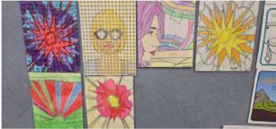
7 - Ben Day Dot art