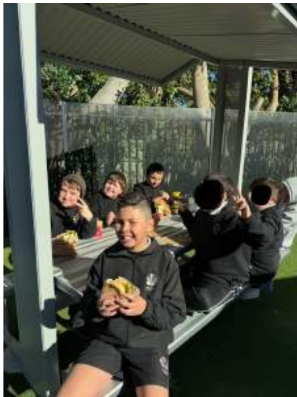
3 - Carinya Cafe