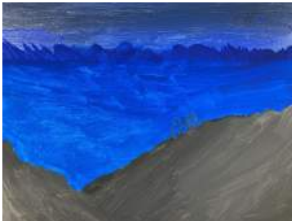
13 - Archie (minus Sisyphus)