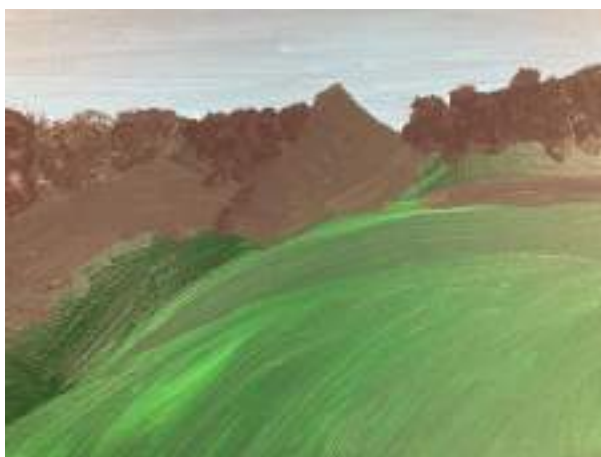
14 - Zac