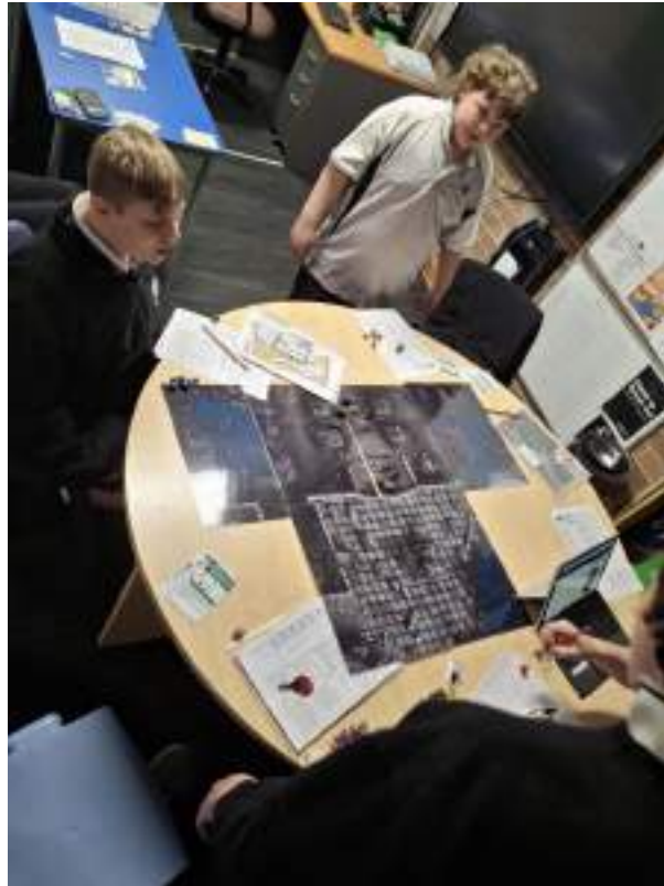
4 - Friday activities