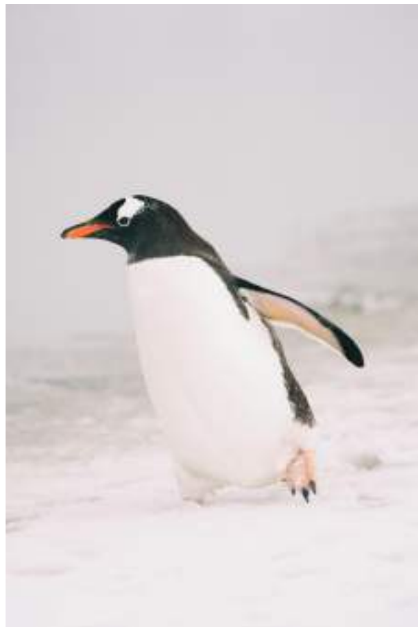
4 - One of our morning writing pictures