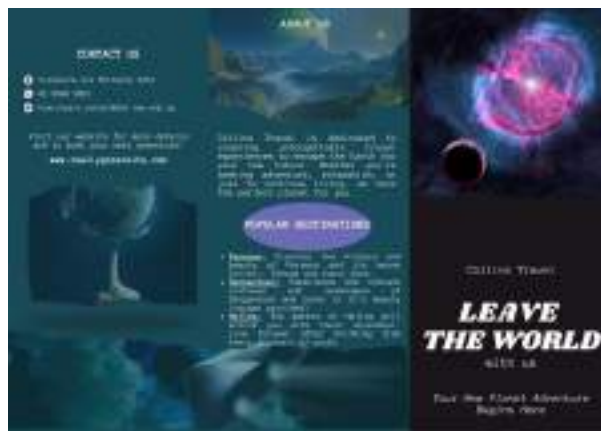
10 - Travel brochure example