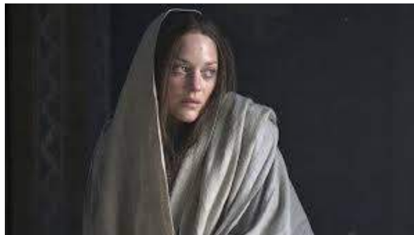
8 - Lady Macbeth