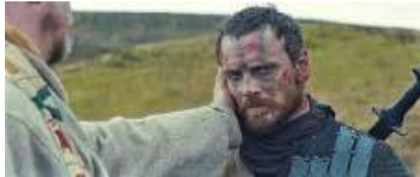
7 - Macbeth