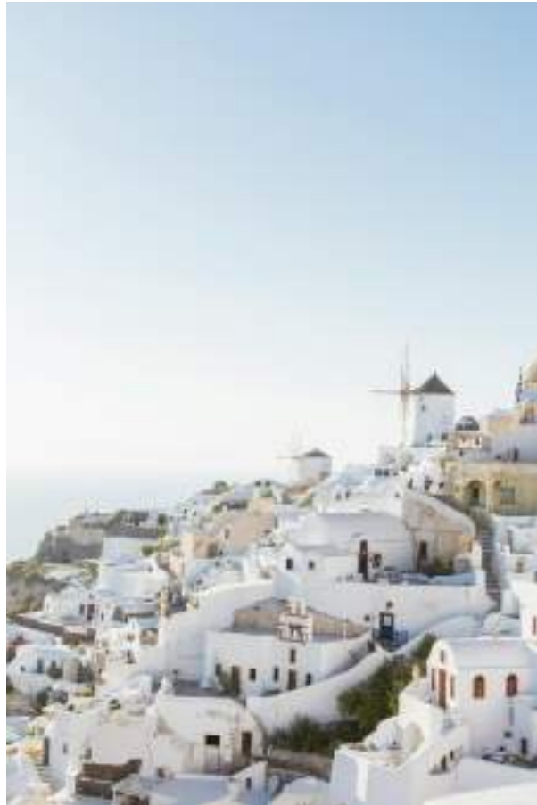
5 - Another morning writing picture