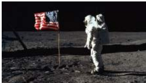
6 - 1969 moon landing