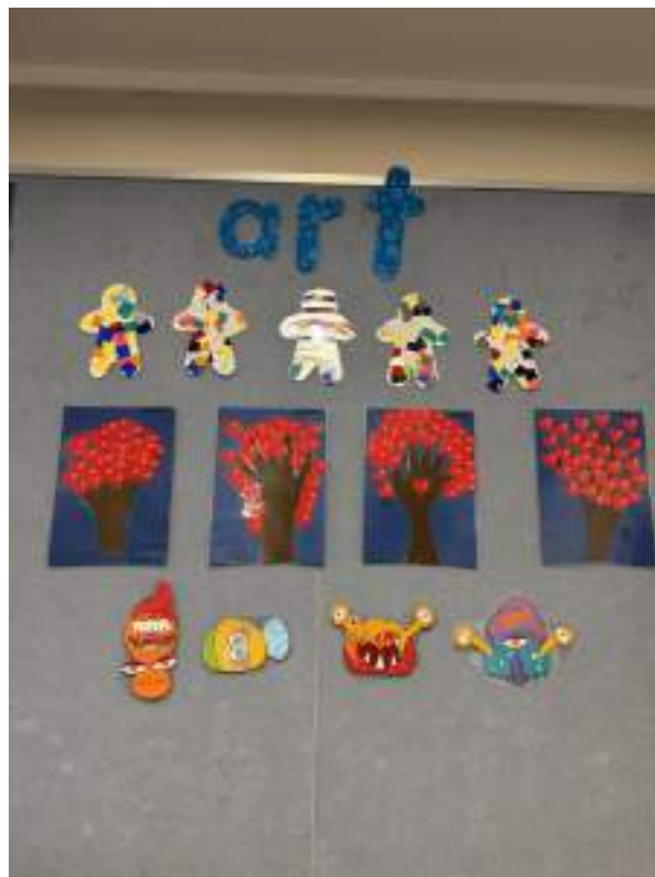
2 - Class 1 art projects