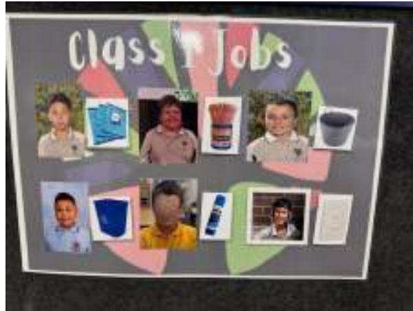
1 - Class 1 Jobs for Week 6