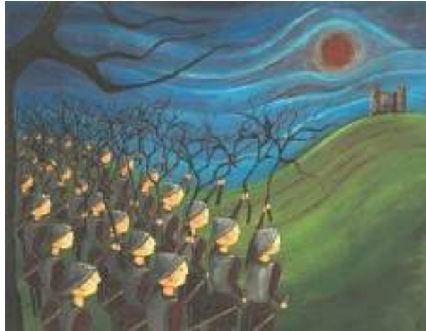
9 - Burnham Wood comes to Dunsinane