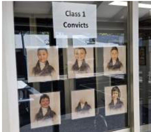
3 - Class 1 Convicts