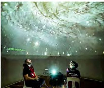
Planetarium MACQUARIE UNIVERSITY ASSOCIATION FOR ASTRONOMY

Just some of the activities you will experience: