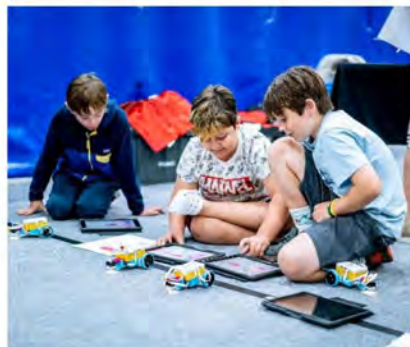
Spike LEGO MACQUARIE UNIVERSITY JUNIOR SCIENCE ACADEMY