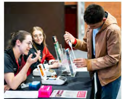
DNA extraction MACQUARIE UNIVERSITY FACULTY OF SCIENCE AND ENGINEERING