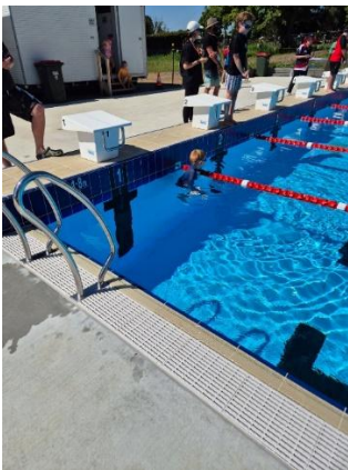
Students enjoying the pool at the swimming carnival.