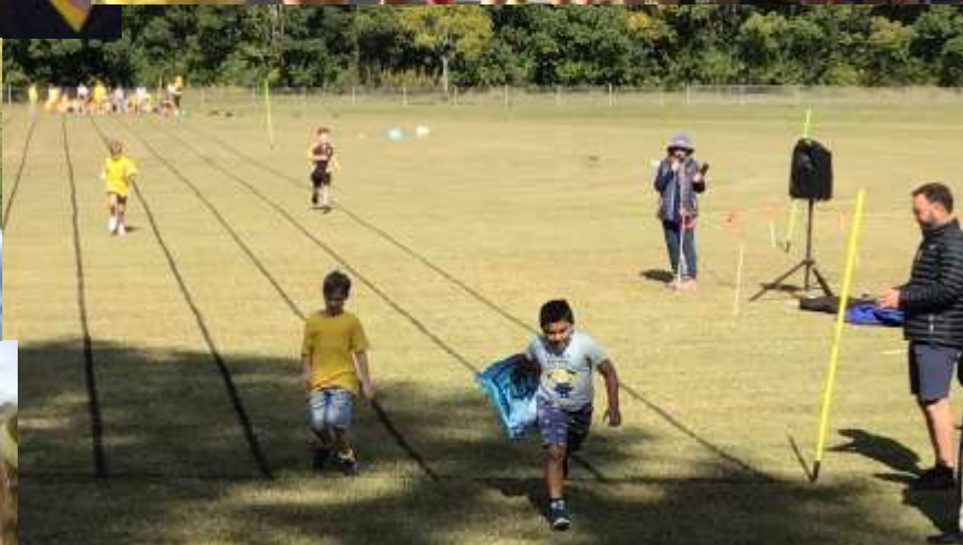
Bexhill Athletics Carnival - 27 June 2025